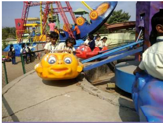
Grade 2- Trip to S.cube