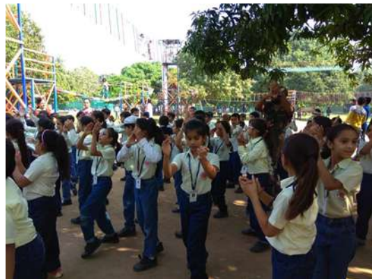
Grade 3- Trip to Camp Dilly